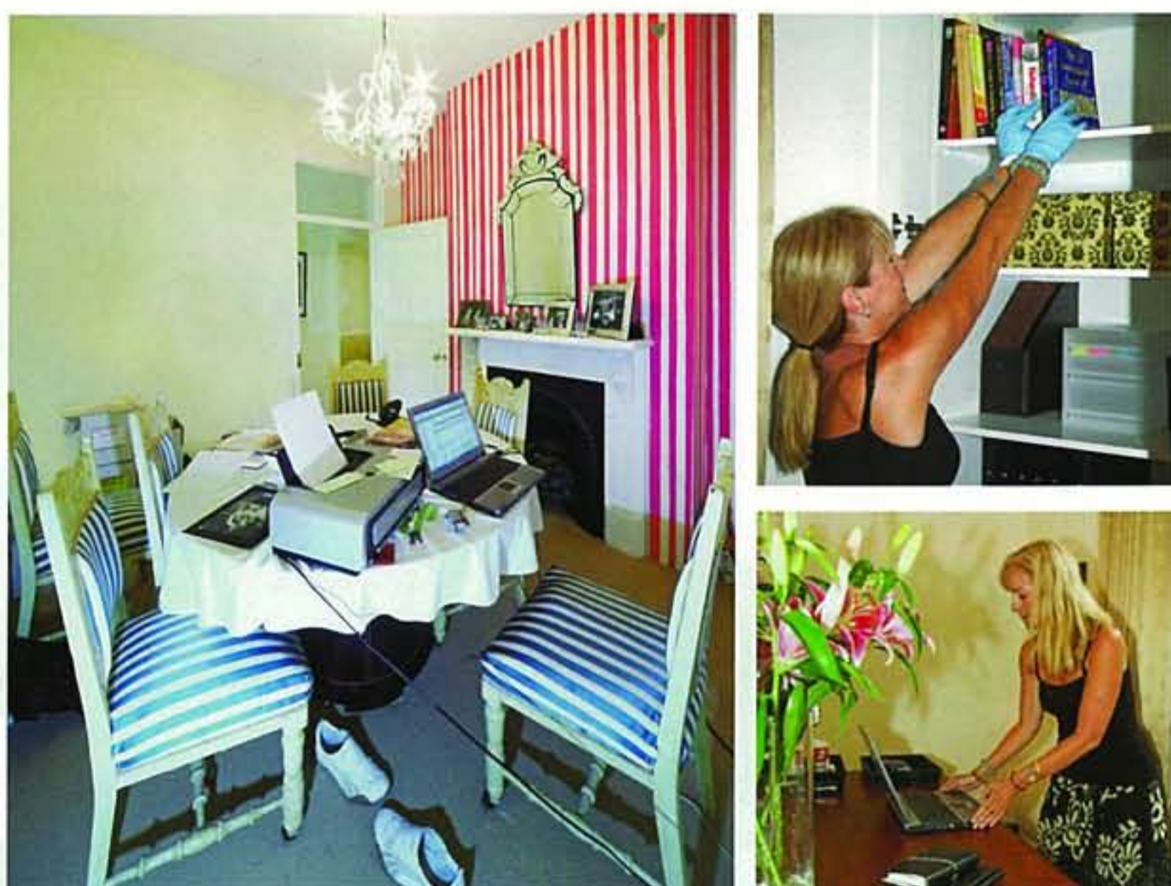
The client's dining room/office.

For more information, visit www.getorganised.com.au